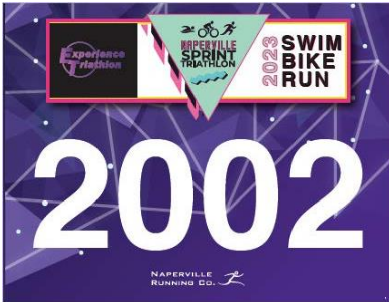
Run Course Bib